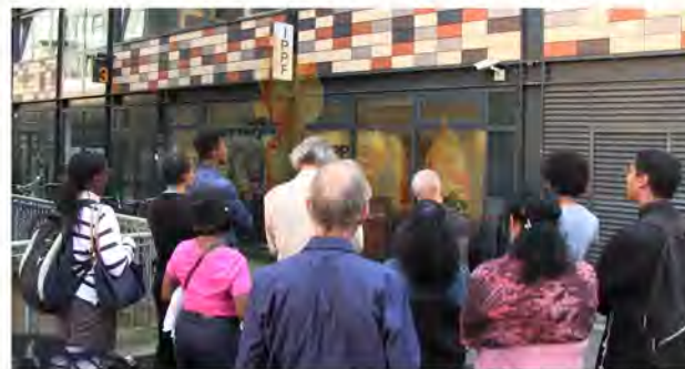
Praying at the global HQ of IPPF