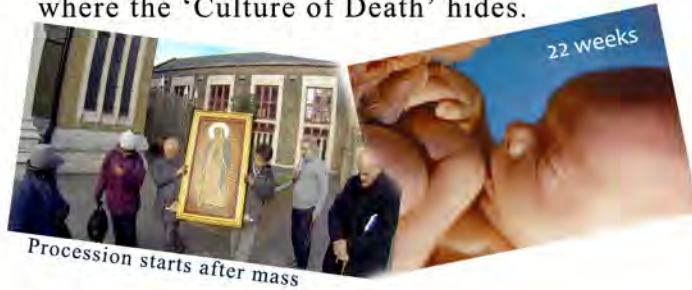
Procession starts after mass

It is part of monastic liturgy of the hours prayed through the night. In 1989 Bishop Daily & Msgr. Reilly encouraged believers to enter into the night spiritually by praying and singing peacefully in the darkest place in the city where the 'Culture of Death' hides.